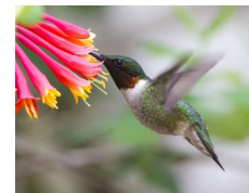
Trumpet Honeysuckle ( Lonicera sempervirens )