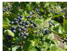
Arrowwood Viburnum ( Viburnum dentatum )