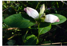
White Turtlehead ( Chelone glabra )