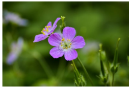
Wild Geranium ( Geranium maculatum )