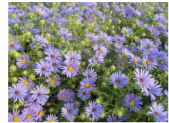
Aromatic Aster ( Symphotrichum oblongifolium )