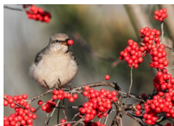
Common Winterberry ( Ilex verticillata )