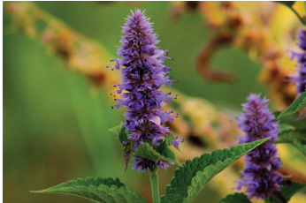
Anise Hyssop ( Agastache foeniculum )