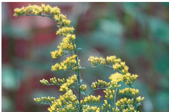
Eastern Gray Goldenrod ( Solidago nemoralis )