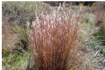
Little Bluestem ( Schizachyrium scoparium )