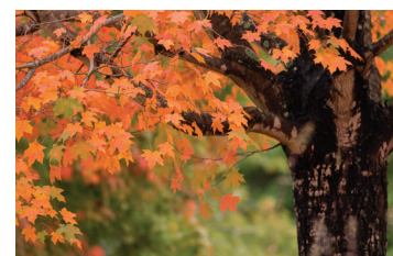
Sugar Maple ( Acer saccharum )

Learn more about Appalachian Audubon's Bird-Friendly Communities, the annual Birdy Dozen, and what you can do to make your yard a haven for birds at https://www.appalachianaudubon.org/bird-friendly-communities .