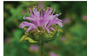
Wild Bergamot ( Monarda fistulosa )