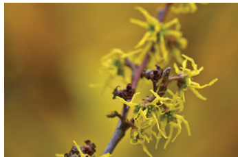
Northern Witch-Hazel ( Hamamelis virginiana )