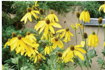
Cutleaf Coneflower ( Rudbeckia laciniata )