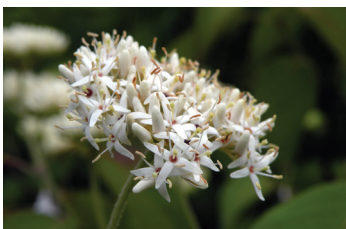
Gray Dogwood ( Swida racemosa )