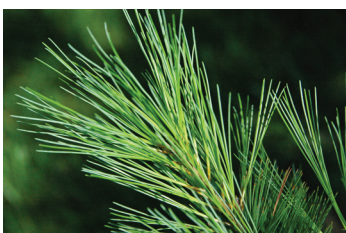
Eastern White Pine ( Pinus strobus )