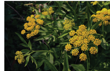
Common Golden-Alexanders ( Zizia aurea )