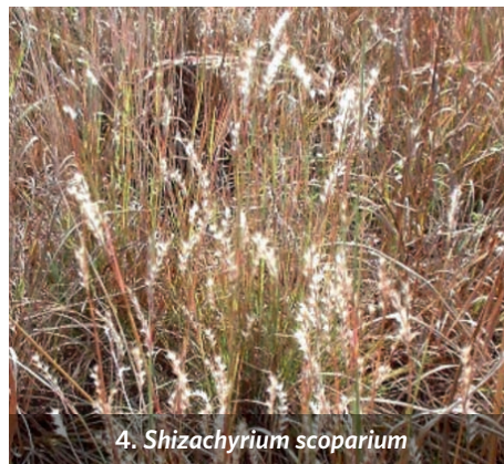
4. Shizachyrium scoparium