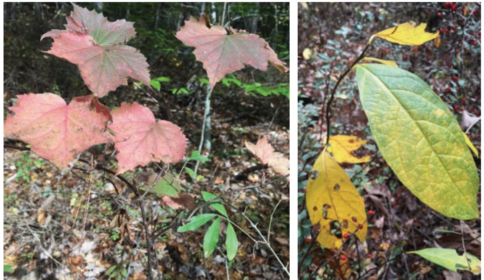
Figure 2. Extended leaf phenology

While some invasive shrubs remain highly understudied, the research that has occurred is spatially limited. A single researcher or research group can only look at so many species and so many places. However, the cues that a plant might use to trigger phenophases such as budburst, flowering, and leaf color change frequently vary across species. Furthermore, the cues themselves, including day-length, temperature and precipitation, vary through space and between years. Is the difference in leaf phenology between a given native and invasive shrub in central Pennsylvania comparable to the difference seen in North Carolina or Missouri? How do these differences vary for other native and invasive