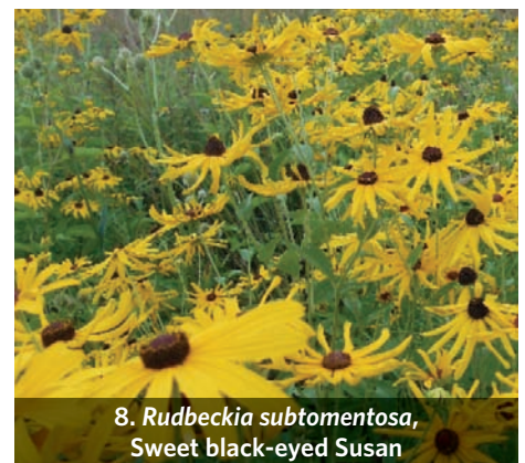
8. Rudbeckia subtomentosa , Sweet black-eyed Susan