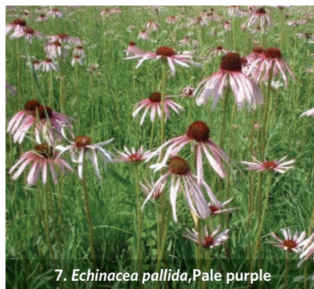
7. Echinacea pallida , Pale purple