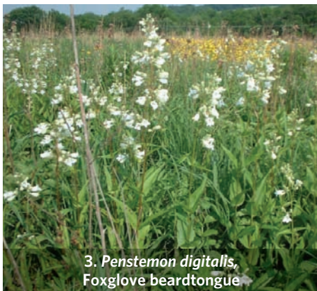
3. Penstemon digitalis , Foxglove beardtongue

In agricultural areas much of the woodland has been cleared of trees affording full sunlight, which supports entirely different types of herbaceous plants and grasses. If you are inclined to grow this type of ecosystem called meadow or prairie, it will require different plants that grow to maturity in the summertime. A list of easy to grow prairie plants for the East has been prepared for the North American Prairie Conference in Normal, IL (1). For these plants, the soil was underlain with shale, but due to the hills and hollows moisture ranged from dry-mesic (dm) through mesic (m) to wet-mesic (wm). It is very