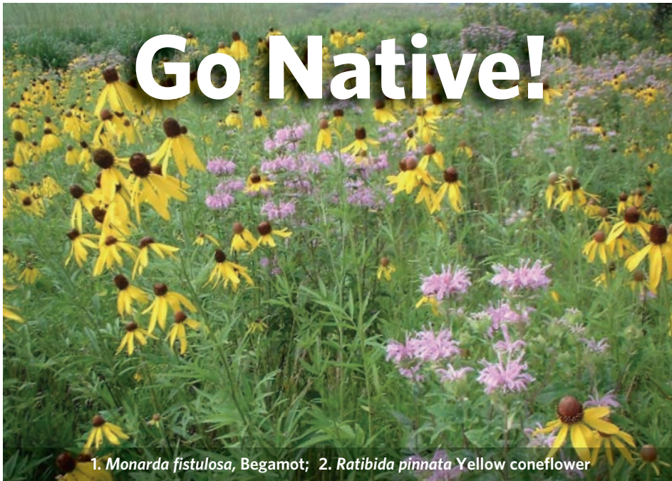
1. Monarda fistulosa , Begonias; 2. Ratibida pinnata Yellow cone flower