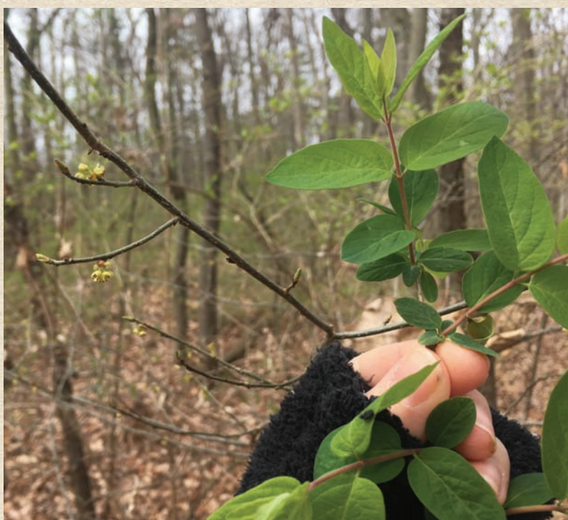
Figure 1. Extended leaf phenology

Picture a bird flitting about in search of insects or fruit. When danger approaches it can swiftly retreat and hide. In contrast, plants are generally rooted in place. Beyond making them comparatively easier to study than animals (much to the chagrin of my colleagues who are currently wading through coldwater streams to relocate radio-tagged fish), it also makes plant survival and success fascinating. Because plants are spatially static, they are dynamic through time. Plants can optimize their fixed situation through the timing of important life history events. For example, young leaves tend to be more delicious and less defended than older leaves. Some plants have been found to break buds and leaf out much earlier than when their insect herbivores emerge, giving leaves time to grow and develop defenses. Yet the benefits of early leaf production have to be balanced with the risks of a late frost and leaf damage. Recurring or cyclic life history events such as breaking leaf buds, flowering, fruiting, fall color change, and senescence are called phenophases . The study of how phenophase timing varies across a landscape and through years is called phenology . You can think of phenology as how tuned a species is to their surroundings. As such, phenology is one of the most important drivers of the success of a species. In fact, species that