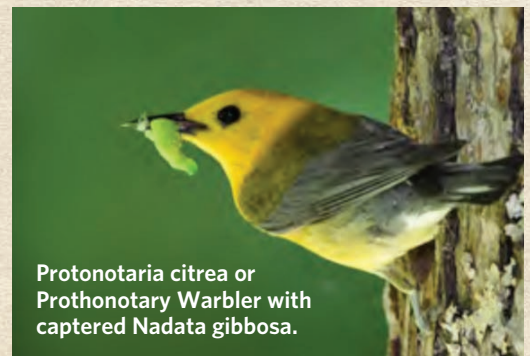
Protonotaria citrea or Prothonotary Warbler with captured Nadata gibbosa.