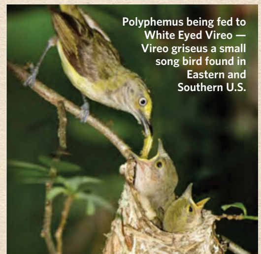
Polyphemus being fed to White Eyed Vireo — Vireo griseus a small song bird found in Eastern and Southern U.S.