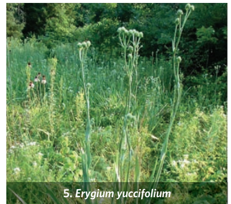
5. Erygium yuccifolium