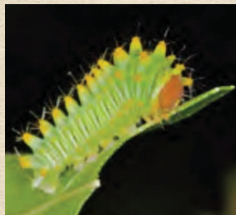
Nadata gibbosa or the White Dotted Prominent feeds principally oak and other Fagaceae.