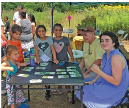
Children play the “Nice Native vs. Icky Invasive” matching game.

At this summer’s Wings in the Park event, PNPS provided an educational opportunity to teach youth the importance of garden stewardship, having children participate in watering the PNPS Demonstration Garden while observing interesting plant and insect interactions. In